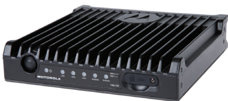
VML750 LTE Vehicle Modem