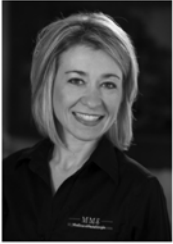
"The Medicare Lady"